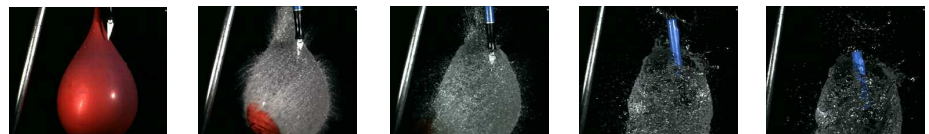
Image capture with MotionPro ® HS-4 camera may be initiated via software or a wide variety of external triggers including optical, acoustic, or electrical, as well as simple hand-held switches. Flexible recording options allow the user to capture pre-selected numbers of frames before and/or after receiving a trigger or to employ a double-exposure mode, which, with a 100 nanoseconds inter-frame time, is perfect for motion analysis on objects moving at very high speeds. Memory may be divided into multiple sessions with or without automatic download to assure no event is missed.

The extensive image processing algorithms include binning (2x2, 3x3, and 4x4), filtering, advanced color control, and programmable LUT enable you to maximize the image quality under various lighting conditions.