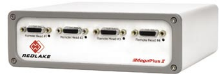
MegaPlus II ES 3200 with controller