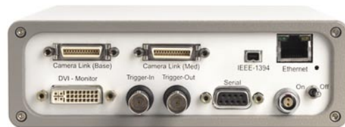
MegaPlus II controller (back)