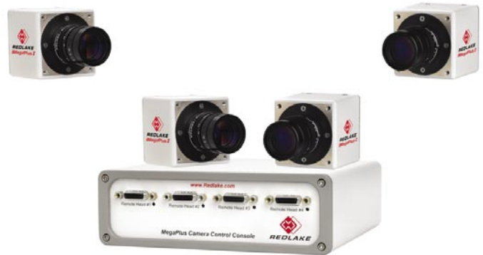
MegaPlus II ES 2093 with controller

With outstanding image quality and flexibility, the ES 2093 and controller are ideal for most machine vision, aerial photography, and scientific imaging applications.