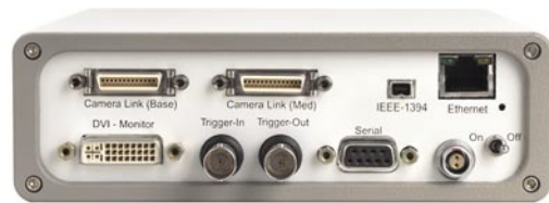
MegaPlus II controller (back)